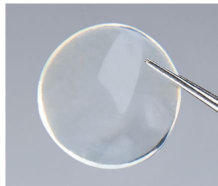
Sterile Clear Corneal Allograft

Corneal diseases impact over 6 million people, yet only 1 out of every 70 corneal transplants needed worldwide are fulfilled. 2,3